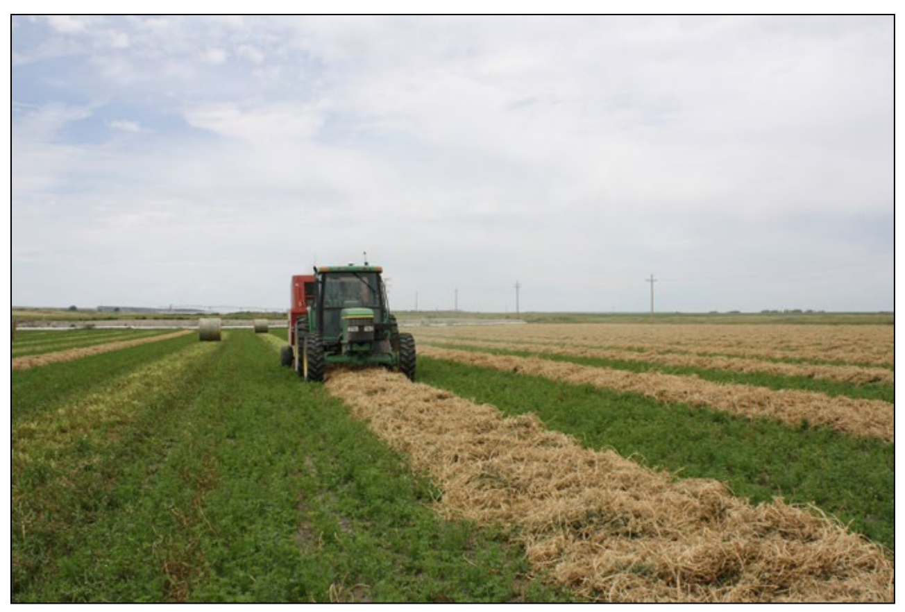
Alfalfa baling at SAREC

Groose, R. 2012. Climatograms for the study area. Available at http://www.uwyo.edu/plantsciences/afri-cap-legumeadoption/_files/pdfs/climatograms.pdf (verified May 21, 2013).