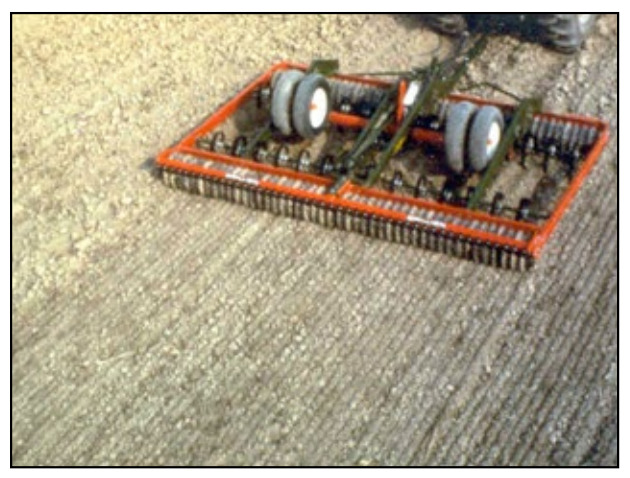
Cultipacking or roller-harrowing helps level soil, break up clods, push rocks into the soil surface, and firm soil for good seed-to-soil contact.

Planting too deep is the most common reason for forage seeding failure. The rule-of-thumb in agronomy is not to plant a seed deeper than five times its diameter. This means most forage seeds should not be planted deeper than 3/8 inch. Greater than 3/8 inch greatly increases the risks of poor emergence and thin stands.