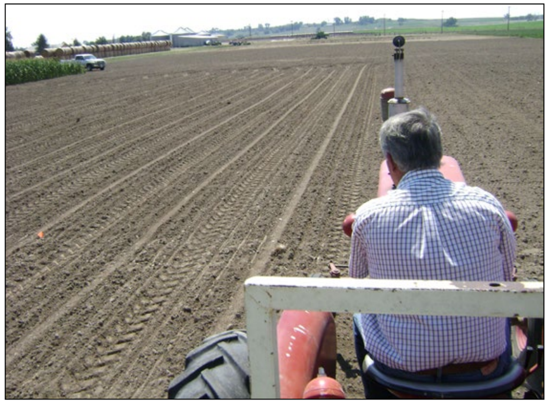
Forage crop planting at SAREC