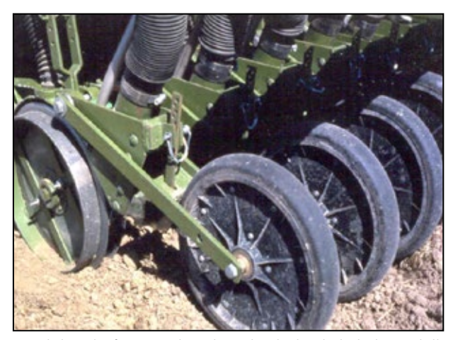
Depth bands (front) and packer wheels (back) help keep drill from placing seed too deep and make good seed-to-soil contact.

A firm seedbed is critical to assure accurate seeding depths. Fluffy seedbeds interrupt the function of the depth band wheels of a seeder; as a result, seeds are frequently placed too deep.