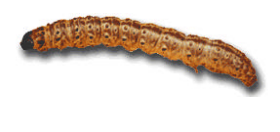
\underline{\text{Copyright}} \ \ \textcircled{0} \ 1997 \ \ \text{Regents of the University of Minnesota}. All rights reserved.